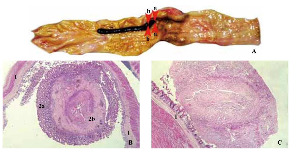
Fig. 2. Autopsy specimen. A: Opened cecum with inverted necrotic appendix and intact cecal wall: histological sections were taken at level a-a at the border between the inverted appendix and the cecum, and at level b-b some millimeters distally; B: Microscopic aspect at level (A-A) showing intact cecal wall (1), inverted mucosa of the appendix stump (2a), and appendix muscle wall (2b); C: Microscopic aspect at level (B-B) showing necrosis of the appendix, with merely distinguishable mucosa and muscle layer.

class 2. In contrast surgery without opening the bowel like in inversion of the appendix is defined as a clean procedure class 1.<sup>[10]</sup> In addition to minimal contamination complementary appendectomy should diminish prolongation of operative time.